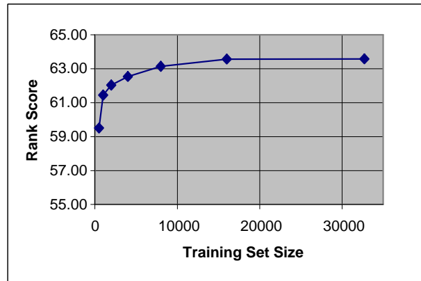
Figure 2: A learning curve showing the effect of sample size on ranked scoring for the correlation method, All but 1 protocol, MSWeb dataset.

The number of items in the usage database used for the memory-based methods was determined by experimenting with the scoring for various sizes of training set. Figure 2 shows the increase in ranked scoring accuracy as a function of size of training set. We used training set sizes (number of users) of 1637 for Nielsen, 5000 for EachMovie, and 32711 for MS Web. Identical training sets were used as the user database for model-based methods, and as the database for learning probabilistic models. Our experiments have found